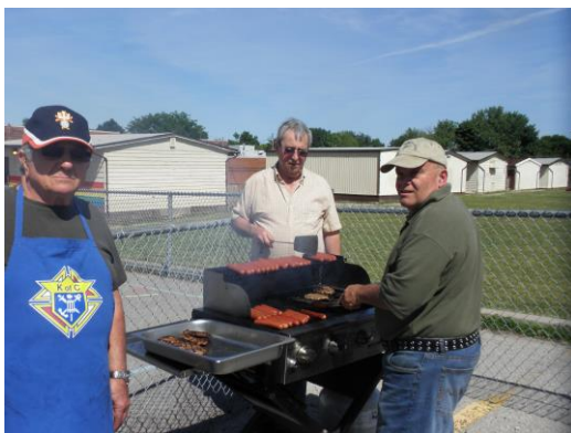
Council 5073 and other Knights prepare food at Canadian Martyrs School