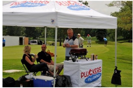
More food provided by Pluckers Wing & Crab Shack