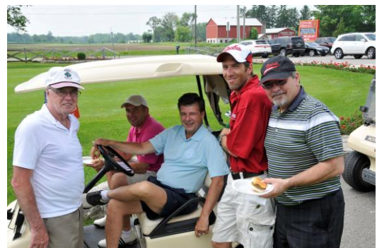
Golfers enjoying a rest