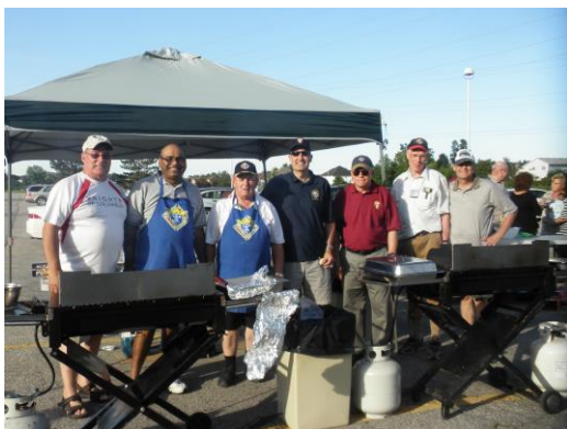
Council 5073 workers at St. Paul's Church BBQ on June 21 st