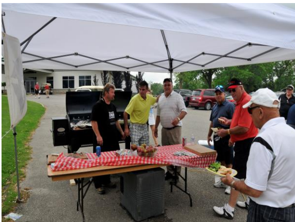
Golfers enjoy a good lunch at Chinwagn